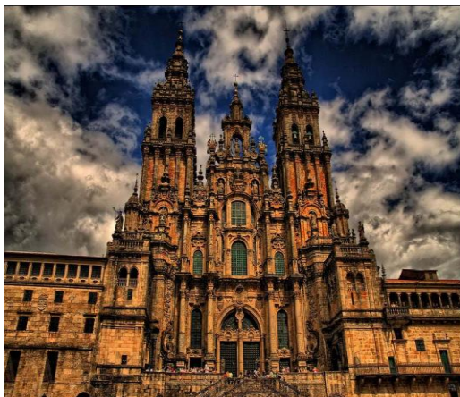
Catedral de Santiago de Compostela