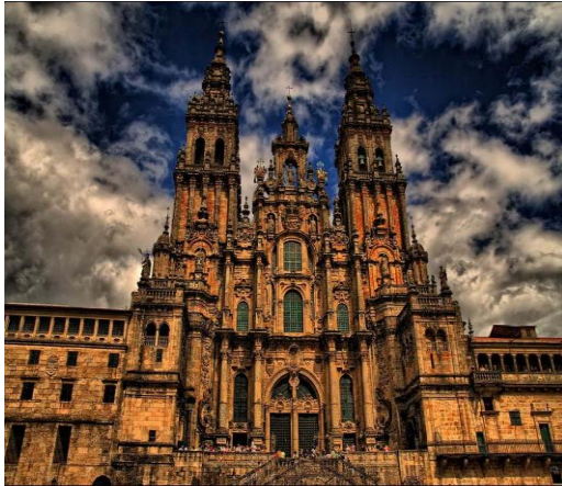
Catedral de Santiago de Compostela

Join us on this truly unique Camino adventure.